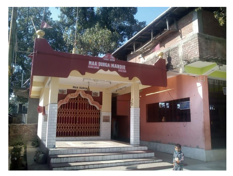
Fig 2: A Temple for the Telis at Telipati, Manipur.

Considering all these facts, it is natural to appear the concepts like 'sons of the soil' and protection of indigenous or native people. The recipient society should have the capability to behold the growing population. The migrants are exerting vibrating waves to the people of Manipur socio-culturally due to their outgrowing population. For example, nowadays, the mainstream society has been outlaid in the accepting trends of certain festivals originated from the Northern India like ' Rakhi Bandhan ' which bears a significant importance of brotherhood and sisterhood. It is an Indian origin festival. This tradition did not exist in Manipur. It appeared within few decades due to influences of the migrants and their forwarding socio-political penetration to the heart of the Manipuris. On the 20th August 2013, the Rakhi Bandhan has been celebrated by 'Brahmakummari Centre' Imphal with dignitaries of Manipur government officials. It has made a proxy gateway of the migrants for infiltration freely and favourable scope for adaptation to the state.